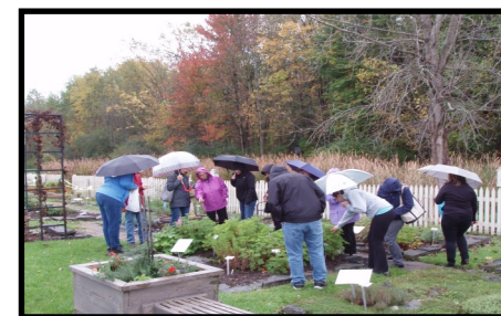
Reviewing herbs for teas class

www.cceoneida.com www.facebook.com/cceoneida