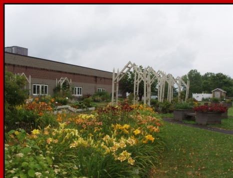
Parker F. Scripture Botanical Garden entrance

The Master Gardener Volunteers maintain the Parker F. Scripture Botanical Garden. We will have popup educational classes during 2019. Review our website on a regular basis cceoneida.com