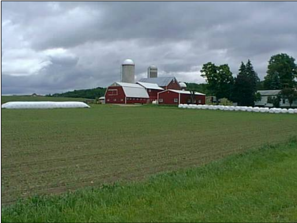
Oneida County.