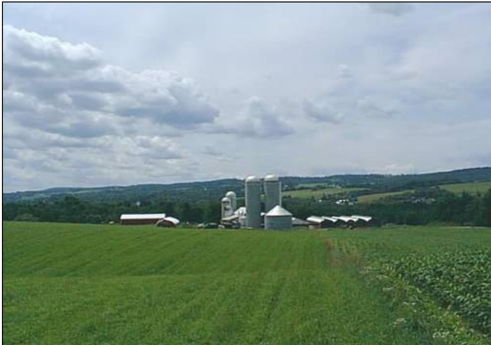
Oneida County.